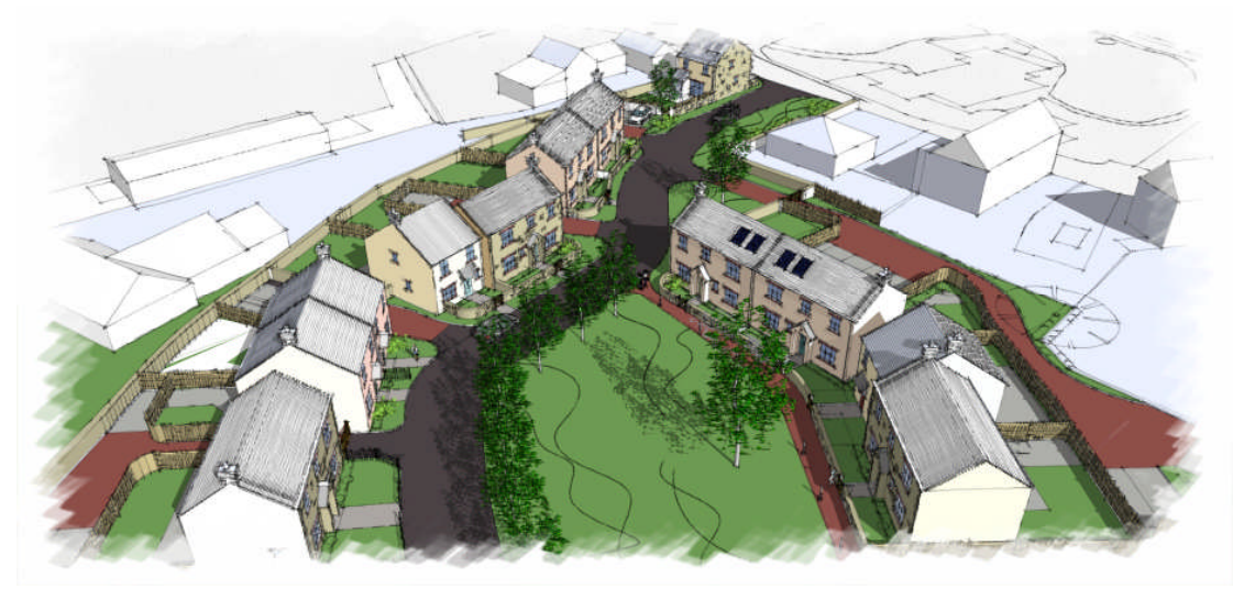
LCT community housing

The LCT's builders, Atkinson Homes have completed works on site with build of the Trusts 12 homes.